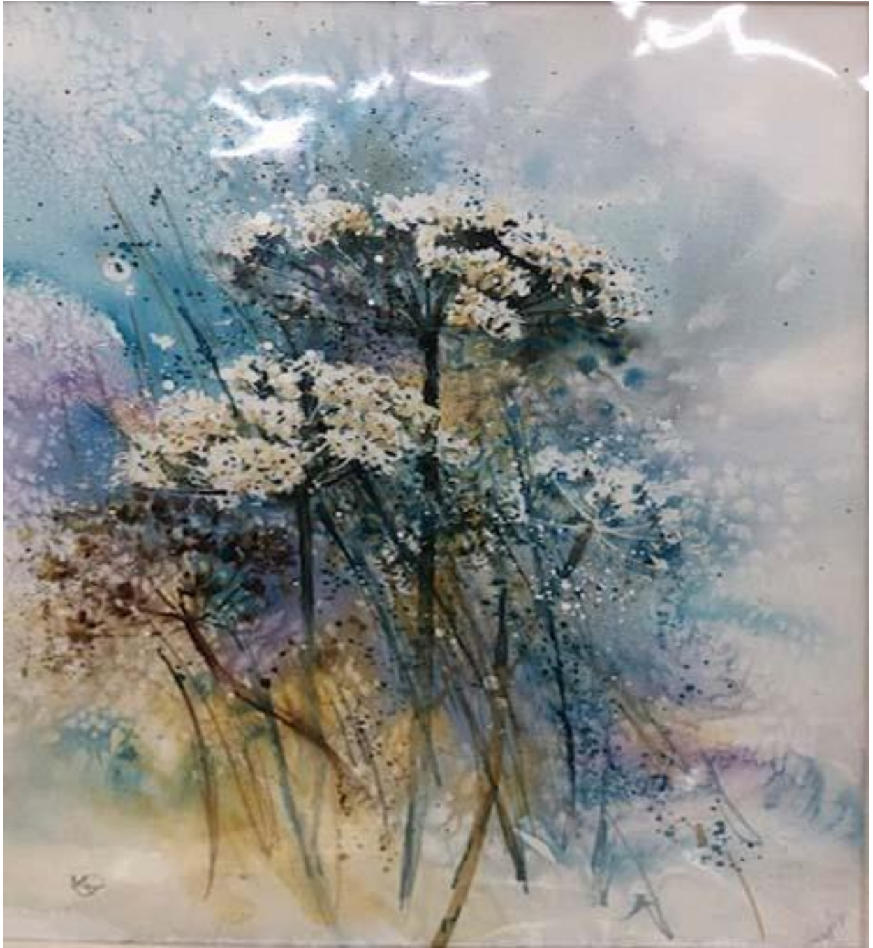
This cow parsley was another of her pictures.