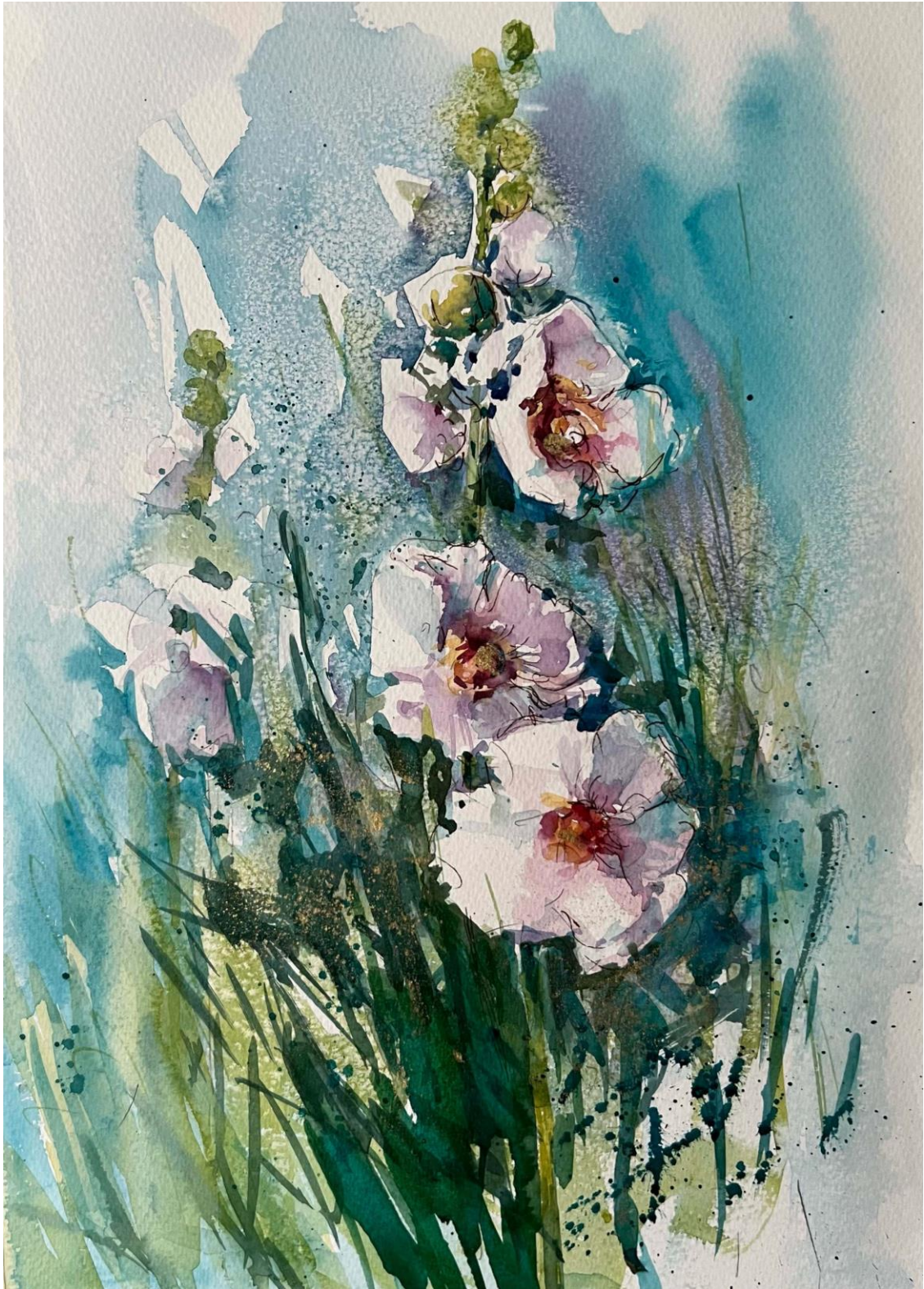
This is the finished picture that Maxine completed at home