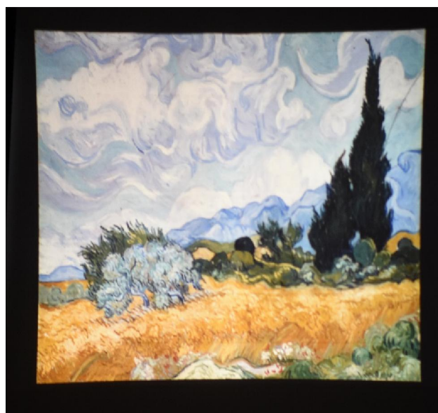
Van Gogh – Cornfield and Cypress Trees