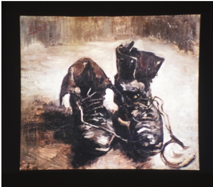
Van Gogh – Old Boots